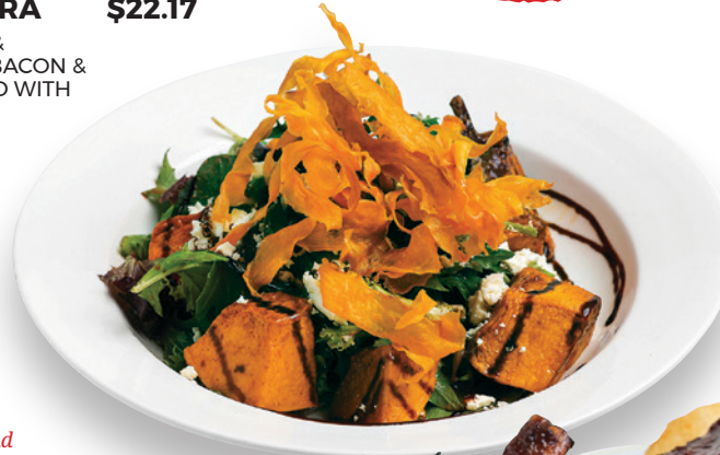
Honey Roasted Pumpkin Salad